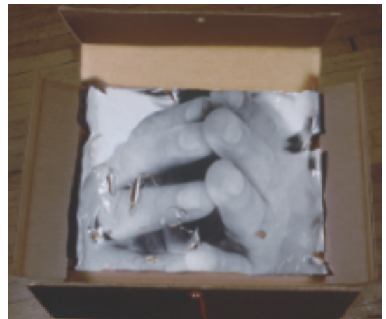
Nature Monochrome: Column, 10"x11"x14"