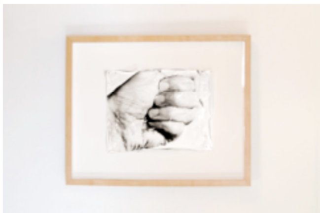
Water Life: Water from the series Time 26"x40" Inkjet Print 1/3 Collection West Family 1998 Memories Untitled(skinned)XIII 11"x14" Silver Print Fragment 1/3 Private Collection 1993

In Memories , for instance, the body, having been photographed, is distorted, crumpled, and extended by literally peeling off the skin of the silver print-its emulsion- and reconstructing the body parts, which are then pinned to the wall. The original impassive images undergo a procedural violence akin to a real bodily violence. Although they become powerful images of injury, they