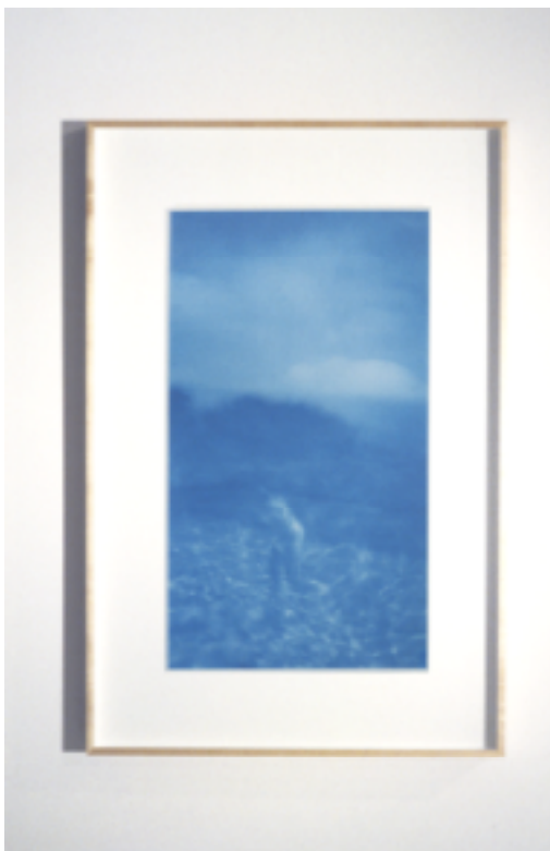
Water Life: Clouds, Tree, Water from the series Time 40"x26" Inkjet Print 1/3 Collection Whitney Museum of Art 1998

Water Life features Hope Sandrow's first series of color photographs, figures suspended in swaths of brilliant blue, in a merging of sea and sky. The resulting color prints are part of a series entitled Time , the last in a trilogy that opened with Memories and Spaces . Sandrow... deliberately chose blue because of its reference to the modernist tradition—to the Blue Period paintings of Picasso and the Blue Monochrome series by Yves Klein. The... Water Life installation comprises ninety-three rectangular cardboard boxes containing thousands of spiral snail shells, collected from an Atlantic Ocean Beach near the Mecox Bay Inlet. Sandrow is fascinated by the relationship of the spiral shape of the proportions of the golden rectangle.