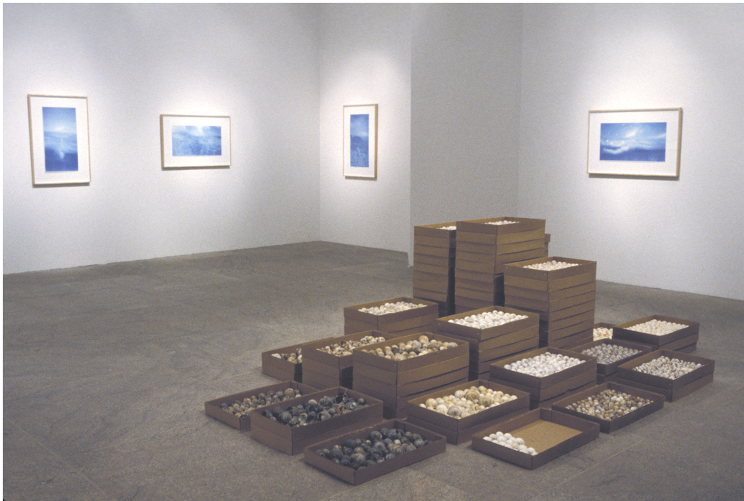
Installation View, detail, Water Life from the series Time Whitney Museum at Philip Morris 1998

Water Life features Hope Sandrow's first series of color photographs, figures suspended in swaths of brilliant blue, in a merging of sea and sky. The resulting color prints are part of a series entitled Time , the last in a trilogy that opened with Memories and Spaces . Sandrow... deliberately chose blue because of its reference to the modernist tradition—to the Blue Period paintings of Picasso and the Blue Monochrome series by Yves Klein. The... Water Life installation comprises ninety-three rectangular cardboard boxes containing thousands of spiral snail shells, collected from an Atlantic Ocean Beach near the Mecox Bay Inlet. Sandrow is fascinated by the relationship of the spiral shape of the proportions of the golden rectangle.