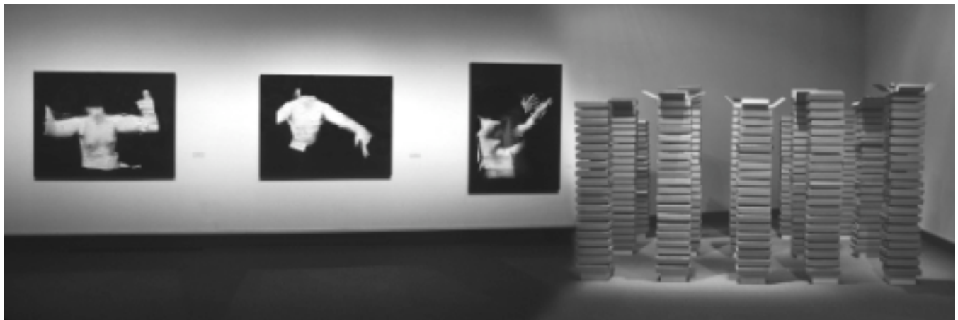
Installation View, SECCA, 1995 Fragments: Self/History, Spaces Untitled VI, VII, VIII 48"x60" Silver Print Fragments, Map Pins 1994 and Artist in the Community: Nature Monochrome VII Boxes with personal objects made by 15 Wake Forest University Art Majors