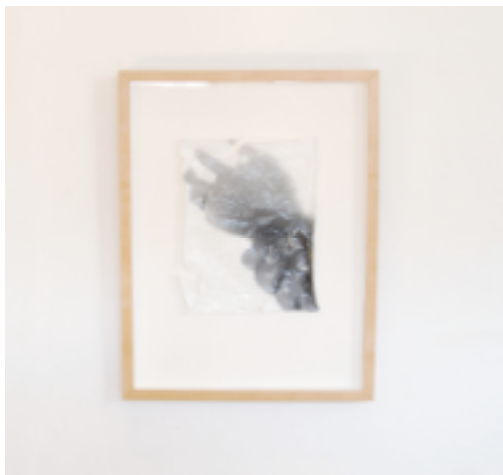
Memories Untitled (skinned) XXXVII 11"x14" Silver Print Fragment 1/3 Private Collection 1993