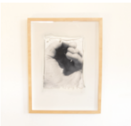
Memories Untitled (skinned) XXVI Silver Print Fragment 14"x11" 1/3 1992 Private Collection

In 1972, the sculptor Robert Smithson noted, "Art should not be considered as merely a luxury but should work within the process of actual production and reclamation." Although Smithson was referring to land reclamation, within about a decade it had become clear that in addition to poisoned, devastated plots of land (and abandoned, "bombed-out" buildings), people, too, had become part of the detritus of the nation's commodity driven progressive-obsessed social structure. If, as Smithson suggested, art can serve as a means of reclaiming areas of land devastated through misuse or neglect, can similar applications be made where people are concerned?. Hope Sandrow, founder of A&HC, would surely say art can. For Arlette Petty, A&HC "gave me hope. Hope for the future...and also I was lucky enough to meet Hope Sandrow." Andrea Wolper, 1995